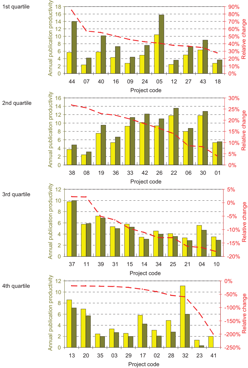
Change of the annual publication productivity from the "before-application" period (light columns) to the "after-application" period (dark columns)